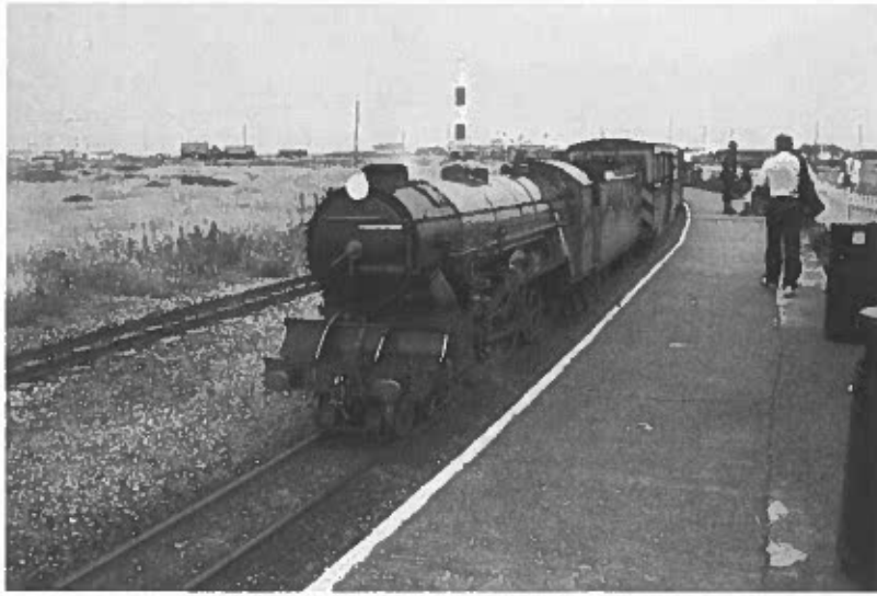
Dungeness Station on the Romney, Hythe and Dymchurch Railway